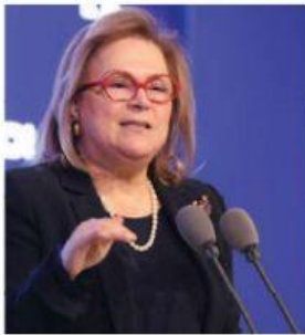
Güler Sabancı (b. 1955)

social media website founder banking entrepreneur