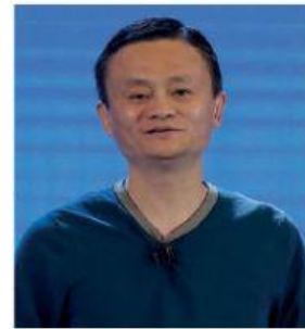
Jack Ma (b. 1964)