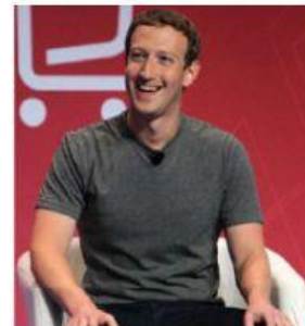
Mark Zuckerberg (b. 1984)