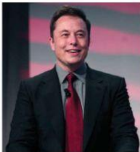
Elon Musk (b. 1971)