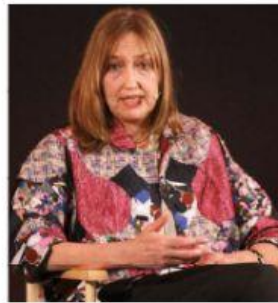
Cath Kidston (b. 1958)