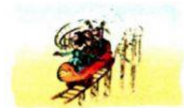
have fun / spend time (with friends)