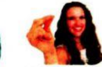
click your fingers