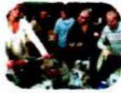
jump a queue