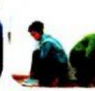
take off your shoes