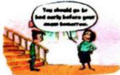
get / give advice