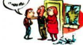
tell the truth