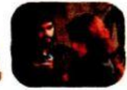
interrupt a conversation