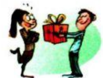
get / give presents