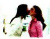
kiss a stranger