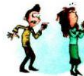
have an argument