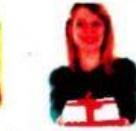
bring a present