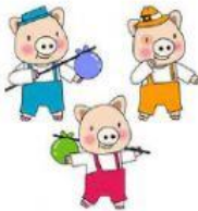
Three Little Pigs