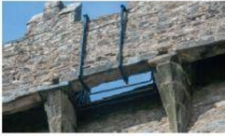
1) Blarney Stone

Part A: Match the pictures of Irish landmarks and icons to the descriptions below