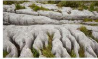
3) the Burren