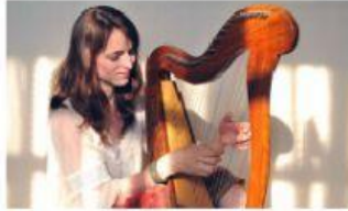
5) Celtic harp