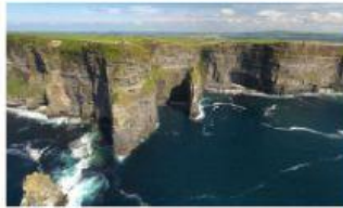
8) Cliffs of Moher