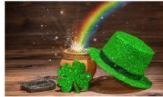
9) St. Patrick's Day