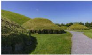
7) Brú na Bóinne