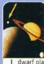
I dwarf planet