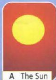
A The Sun