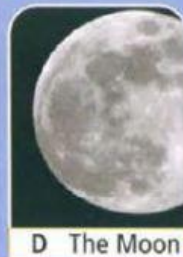
D The Moon