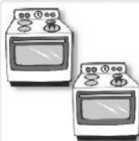
2 cooker s