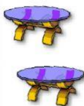
2 table s