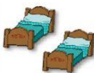
2 bed s