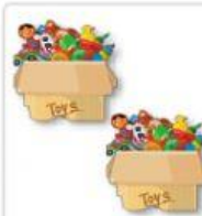
2 toy box es