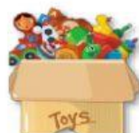
1 toy box