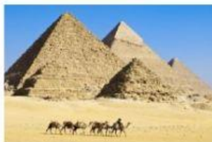
Bernard Egypt The Pyramids