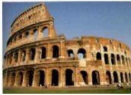
Francisco Italy The Colosseum