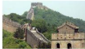
Carlo China The Great Wall of China