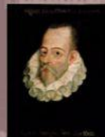
Miguel de Cervantes