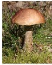
I ..... MUSCHROOM. 😞