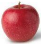
I ..... APPLE. 😊