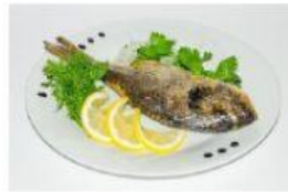
I ..... FISH. 😞