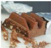
I ..... CHOCOLATE. 😊