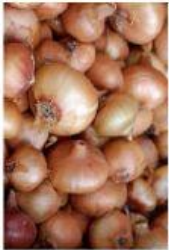
I ..... ONIONS. 😞