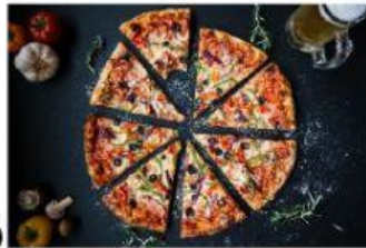
I ..... PIZZA. 😊