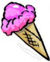
I ..... ICE-CREAM. 😊