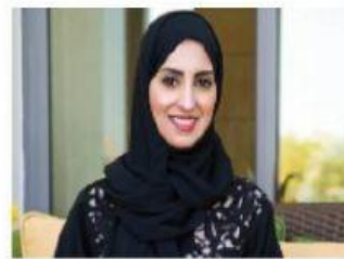
mā mā 妈妈 mother