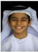
gē gē 哥哥 elder brother