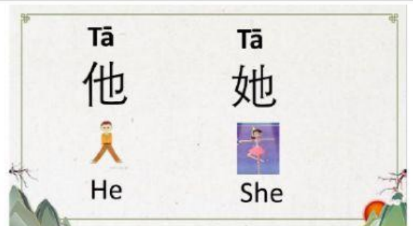
Tā 他 He