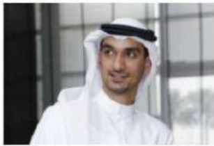
bà ba 爸爸 father

1. Click the picture to listen the words and sentences, repeat after the sound.