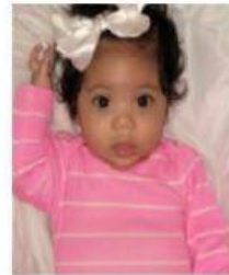
mèi mèi 妹妹 younger sister