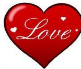
ài 爱 love