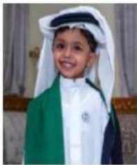
dì dì 弟弟 younger brother