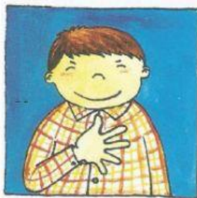
wǒ 我 me/I