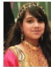
jiě jiě 姐姐 elder sister