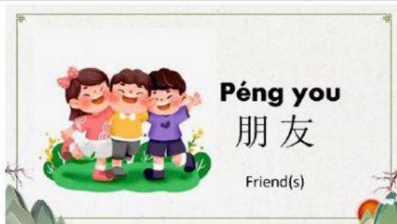
Péng you 朋友 Friend(s)