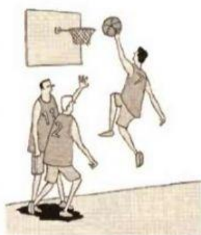
a) do sport