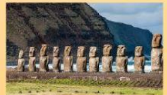
EASTER ISLAND MOAI STATUES