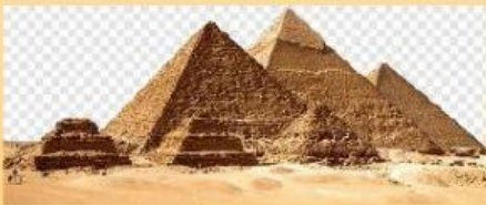
PYRAMIDS OF GIZA