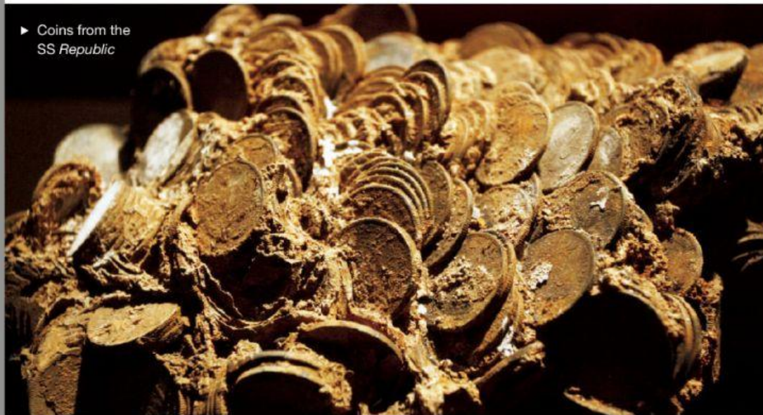
► Coins from the SS Republic

Over 51,000 gold and silver coins were recovered by the Odyssey team from the wreck. Everyday items such as shoes, cups, and bottles were also found by the team. Photos of these artifacts are displayed on the company's website. Facts and details are also given by the company on the site for anyone who wants more information.