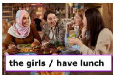
the girls / have lunch