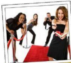
Can fame be harmful to the celebrities?

What about the celebrities themselves? A study in the USA tried to measure narcissism or extreme self-centredness, when feelings of worthlessness and invisibility are compensated for by turning into the opposite: excessive showing off. Researchers looked at 200 celebrities, 200 young adults with Masters in Business Administration (a group known for being narcissistic) and a nationally representative sample using the same questionnaire. As was expected, the celebrities were significantly more narcissistic than the MBAs and both groups were a lot more narcissistic than the general population.