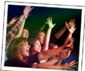
Researchers have identified three kinds of fans

That leaves 2% of young people with a 'borderline-pathological' interest. They might say, for example, they would spend several thousand pounds on a paper plate the celebrity had used, or that they would do something illegal if the celebrity asked them to. These people are in most danger of being seriously disturbed.