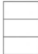
side or end