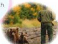
3. Duke Wellington

"You can _____ by doing _____ things, like _____ how much water you use," said the park ranger.