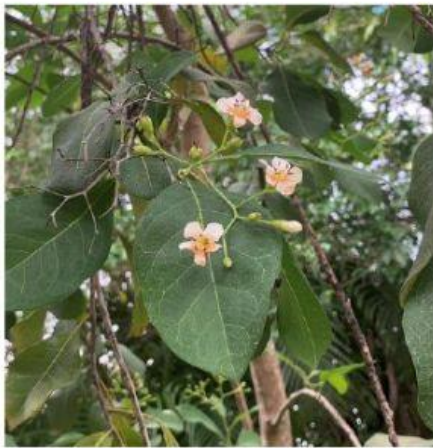
C) Strong Bark