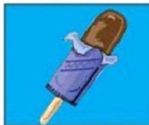
an ice cream