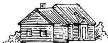
country house: 10 bedrooms