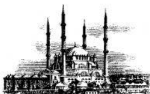
Istanbul: 805 mm rain

The flight from London to Venice is shorter than the train journey. _____