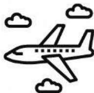
flight London to Venice: 3 hours 1 short