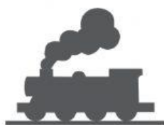
train journey : 2 days

The flight from London to Venice is shorter than the train journey. _____