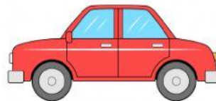
In the car

Where are Matt and his Dad going at the end of the story?