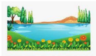
At the pond