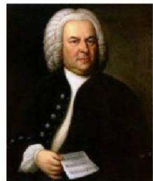
Johann Sebastian Bach