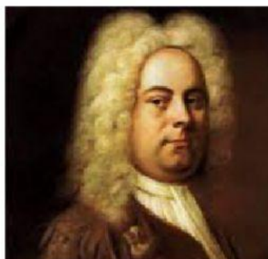
Georg Friedrich Haendel