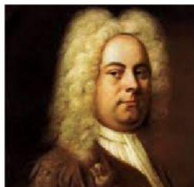
Georg Friedrich Haendel