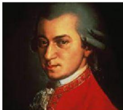
Wolfgang Amadeus Mozart.