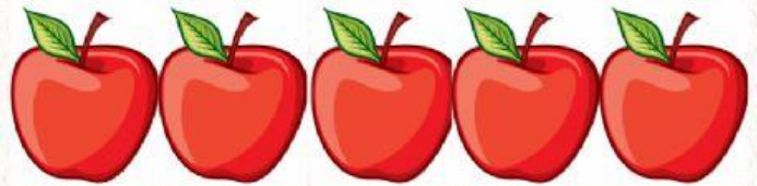
These are apples