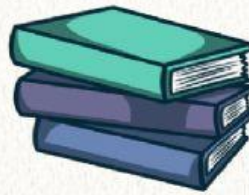
These are books