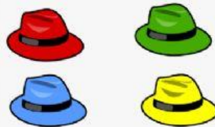
These are hats