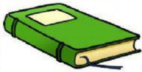
This is a book