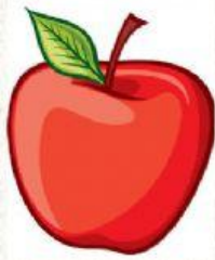
This is an apple