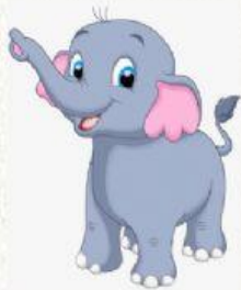
This is an elephant