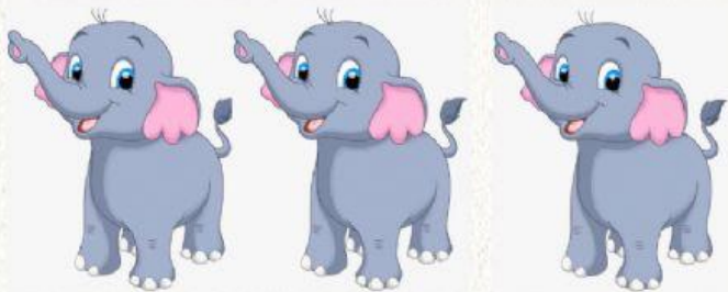
These are elephants