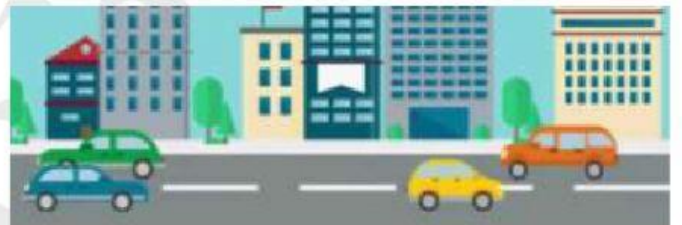
cars the road.