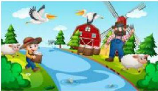
a river the farm