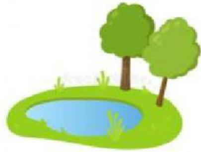
a lake the trees.