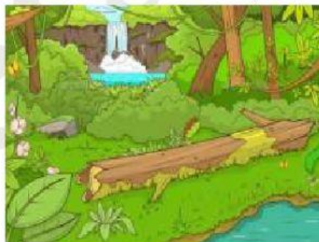
a waterfall the forest .