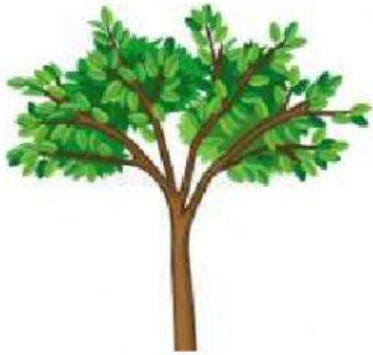
leaves the trees.