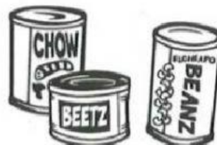
Canned food tins