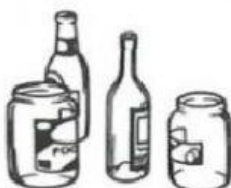
Glass jars and bottles