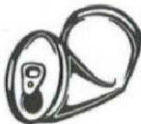
Crushed aluminium cans