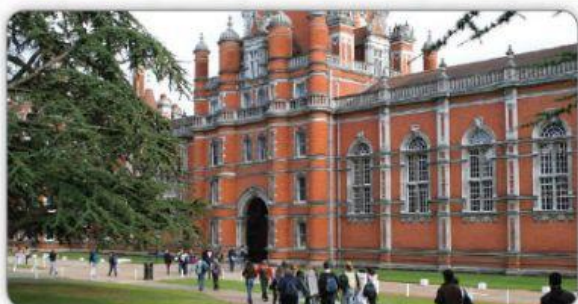
the University of California