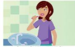
brush my teeth