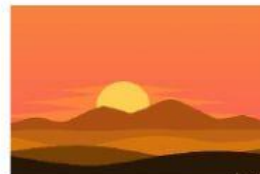
in the evening