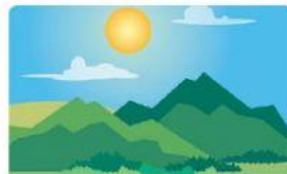
in the afternoon