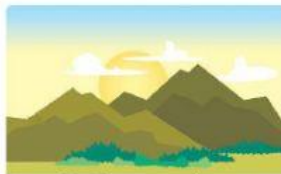
in the morning