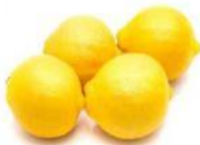
Four lemons or limes