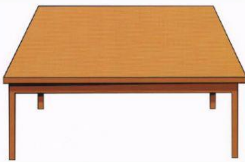
TABLE - PICTURE