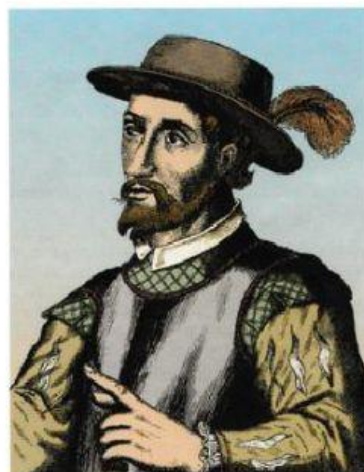
The Spanish explorer Ponce de León