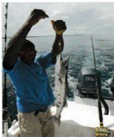
Deep sea fishing