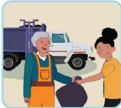
1. throw garbage in the street / wait for the garbage truck

Look at the pictures and write sentences using should or shouldn't.