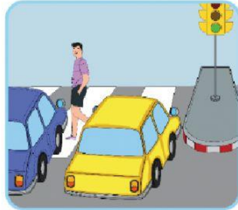
4. respect the traffic lights / ignore the crosswalk