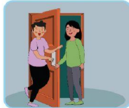
2. be polite with others / be rude