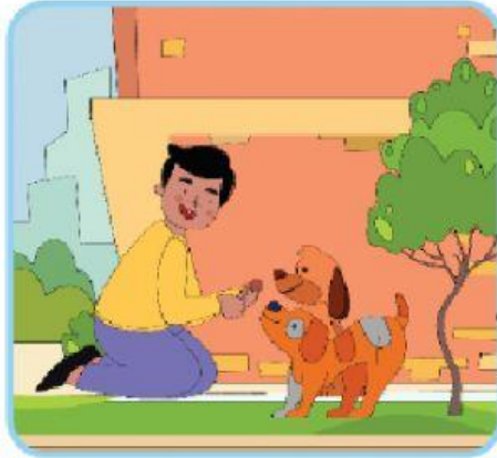
3. feed stray dogs / hit them

You shouldn't throw garbage in the street and you should wait for the garbage truck.