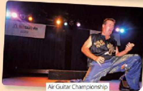
Air Guitar Championship