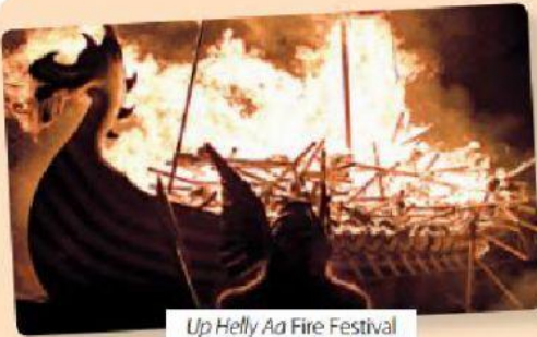
Up Helly Aa Fire Festival

Benny's year started at the Up Helly Aa fire festival in the Shetland Islands, north of Scotland. On the last Tuesday of January, the small town of Lerwick goes mad for 24 hours. At 7.30pm, 1,000 'guizers', men dressed as Vikings, carry flaming torches and a replica Viking longship through the streets. There are fireworks, marching bands, and at least 5,000 spectators. At the end of the procession, the longship is burnt in a huge bonfire. I asked if Benny had slept that night. He said the celebrations ended at 8.30 in the morning!