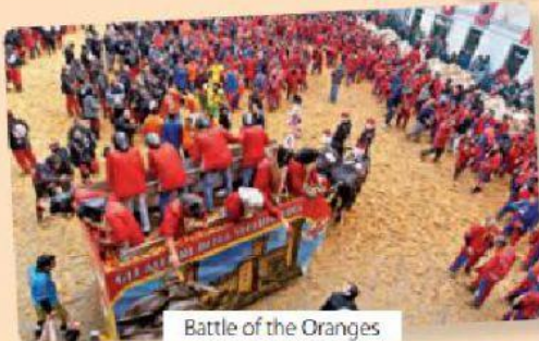
Battle of the Oranges

Read the following text "Benny's weird festivals and then complete the table below with specific information about the festivals presented in this article.