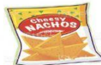
A bottle of nachos