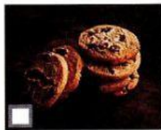
chocolate chip cookies