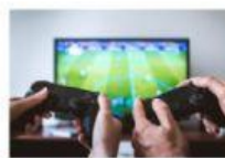
Playing video games