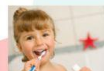
Brushing the teeth