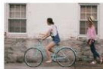
Riding a bicycle