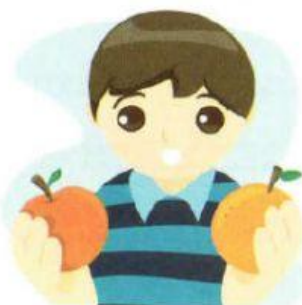
eat healthy food