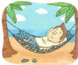
have a rest