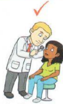
go to the doctor