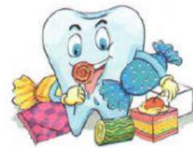
eat many sweets