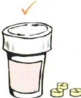
take an aspirin