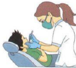
see the dentist