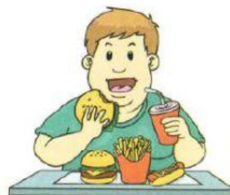
eat junk food