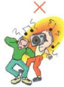
listen to loud music