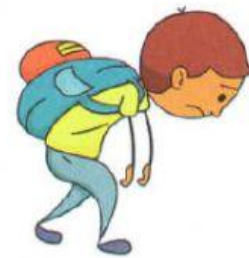
carry heavy things