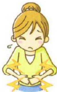
a stomach ache