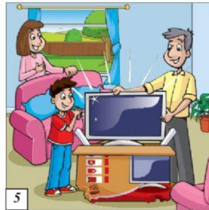
FLYERS SPEAKING. Picture Story