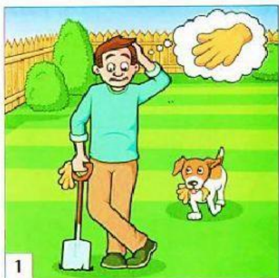
A very good dog