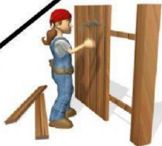
A carpenter uses