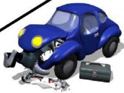
A mechanic uses