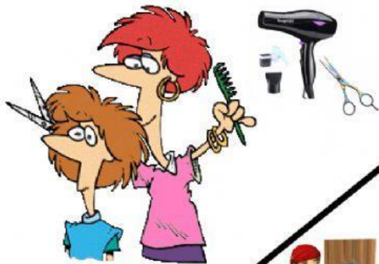
A hairdresser uses