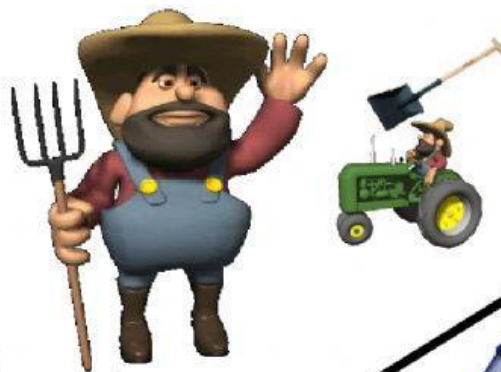
A farmer uses