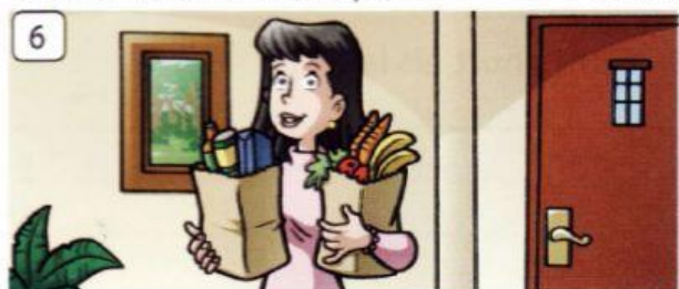
Mum _____ from the shops.