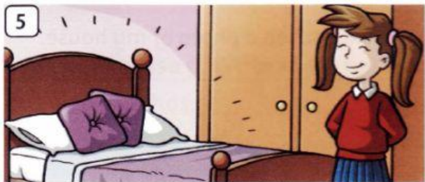
Tina _____ her bed.