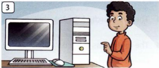
William _____ the computer.