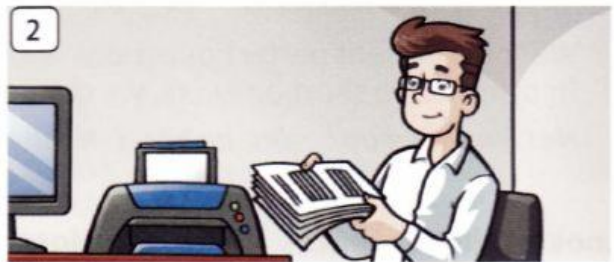
Dad _____ a long document.