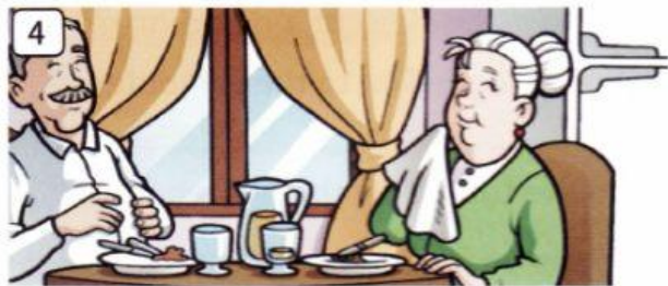
Grandma and Grandpa _____ dinner.