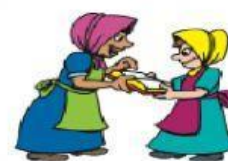
two happy girls