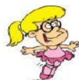
a happy girl

★ Remember: Adjectives do not take -s in the plural.