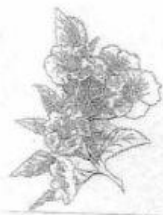
Our national flower