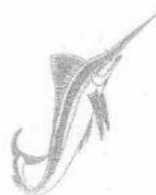
our national fish