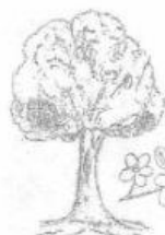
our national tree