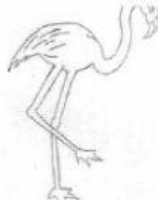
our national bird