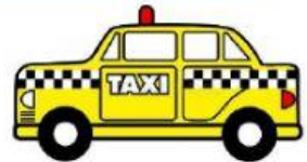
CAB / TAXI