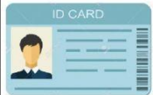
ID (IDENTIFICATION CARD)