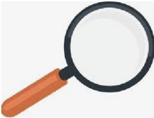
_____ magnifying glass