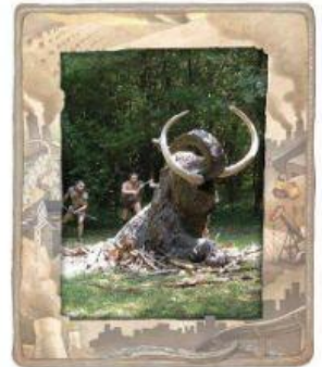
Humans used tools made of stone and wood.

However, humans also had the ability to create and use technology. At first, they used simple technology, like tools made of stone and wood. These tools made it easier to hunt, build, and do other things for survival.