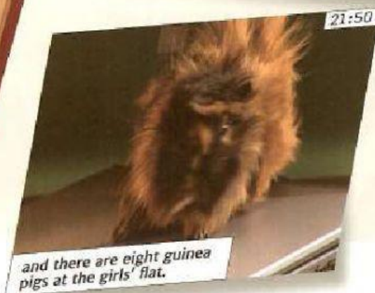
and there are eight guinea pigs at the girls' flat.