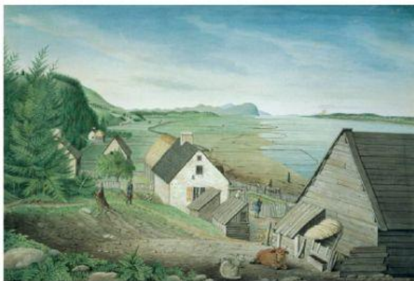
A painting of Chateau-Richer around 1790

Under the French and then later under the British, Chateau-Richer was a successful farm community. At first the farmers, or habitants, learned how to grow or make foods, such as corn or maple syrup, from the First Nations people who lived nearby. Habitant farms were usually long narrow strips next to the river. The farmers lived close to each other. In the painting below, you can see the farm houses all near the water. The habitants worked together to clear land, build farm houses, and other important structures, such as grist mills.