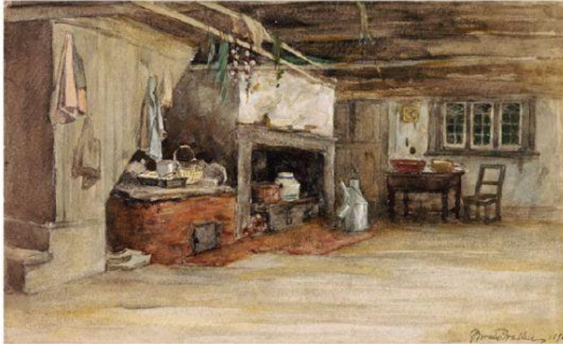
Inside view of a habitant home in the 1800's

Habitant homes were made out of logs. The roofs were very steep because of the heavy winter snow in early Canada. Most homes had a big stone fireplace for heating and for cooking. People slept on beds with straw mattresses. Floors were made of dirt or wood, and furniture was made from wood. Food was kept cold in a root cellar because there were no refrigerators. Unlike modern houses, habitant homes did not have conveniences such as running water, electricity or indoor toilets.