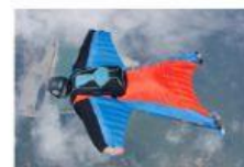
Wingsuits (enable you to fly)