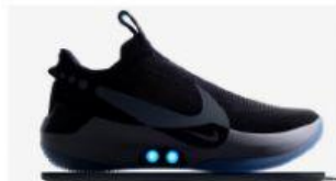
Digital running shoes