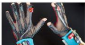
Sign language transition glove