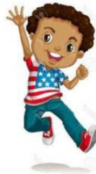
Peter/ 13 / America

a) His name is Nam. He is eight years old. He's from Viet Nam.