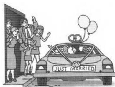
newly married couple